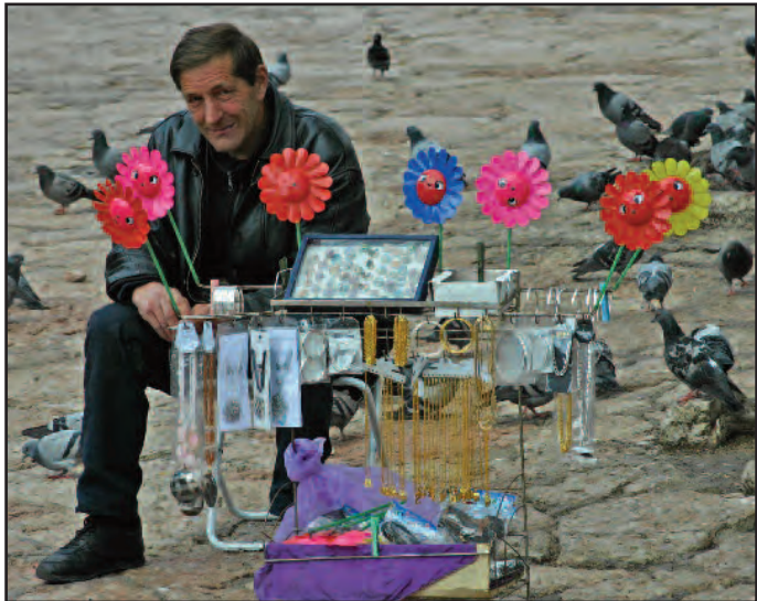
This man sat daily amid the Turkish Quarter in Sarajevo, attempting to sell trinkets in order to make a living. Many Sarajevans do such jobs for a living.