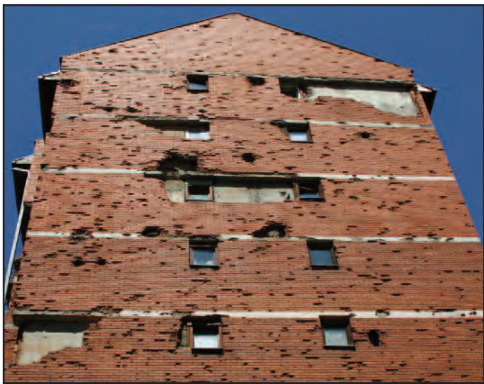
This is the side of a heavily damaged Sarajevo apartment complex, in 2007. The front side is pitted with bullet holes and craters from artillery shells.