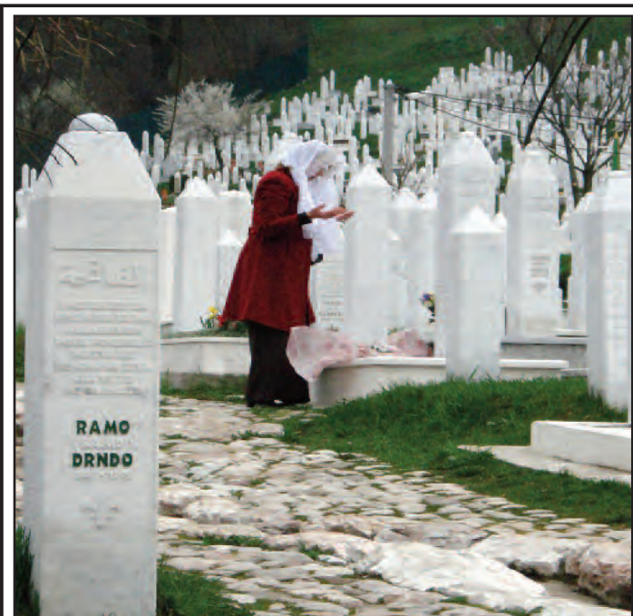
A Muslim woman prays amid a long-unused graveyard that was reopened during Sarajevo's siege. Although much reconstruction has taken place in Bosnia since 1995, the inner wounds of war live on.

Many of Bosnia's youths – their childhoods drastically altered by the war – remain deeply affected, and use social activism and theater work as platforms to speak out against the