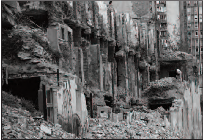
A man shovels away at the former military headquarters in Sarajevo. Little of the infrastructure destroyed in the war has been rebuilt, a failure that limits economic opportunity.