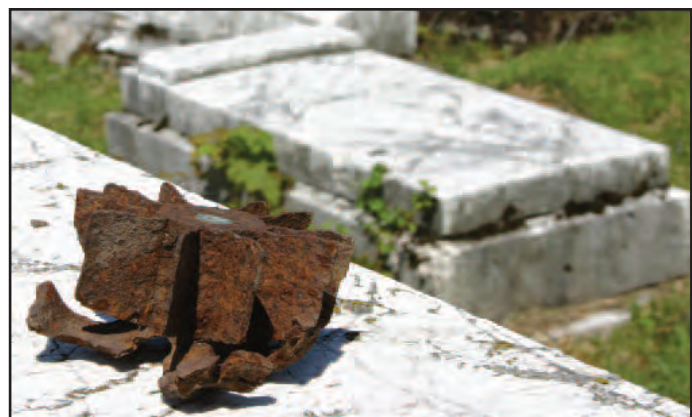
Exploded mortar ("grenade"), discovered in a graveyard where every headstone was toppled: Many thousands of these rained down on Bosnians.