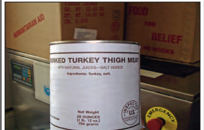
Bosnians relied heavily on international food aid for survival during the war. Health issues related to malnutrition are becoming ever more apparent. High cancer rates and stomach-related ailments are prevalent.