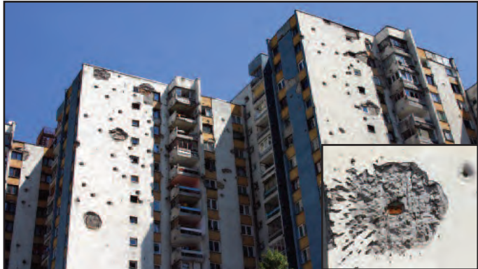
This is an apartment complex pockmarked with holes left by artillery shells – remnants of mass destruction that the world watched from afar.