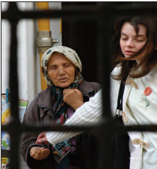
Street beggars are common in postwar Sarajevo. This woman was holding a talking apparatus to her throat in order to attract attention from passersby.

tempted to explain the elation she once felt when an onion like this was divided among the members of her family.