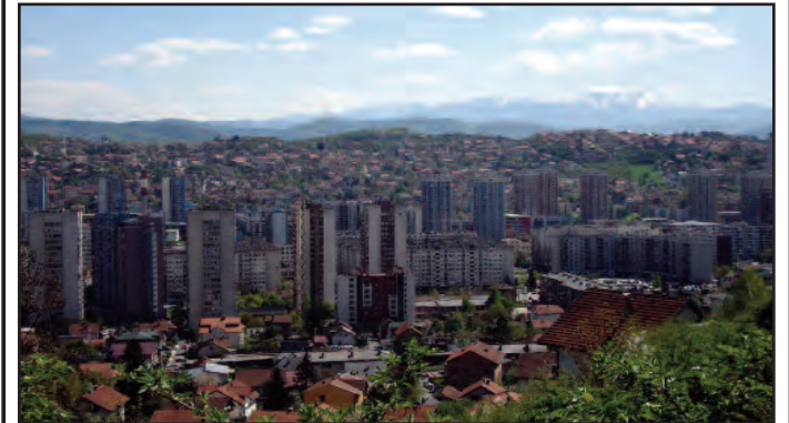
This view overlooks a section of Sarajevo, located at a former Serb tank, artillery and sniper post.