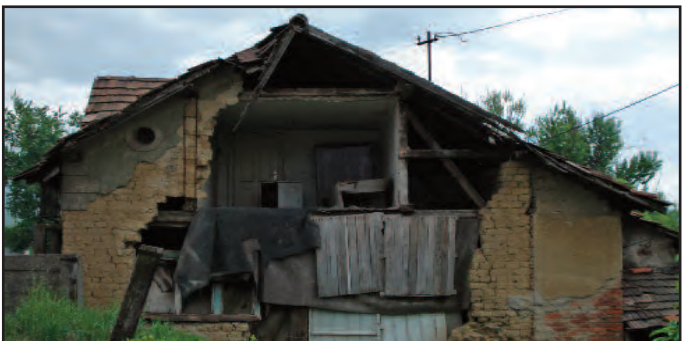
Most Bosnians returned postwar to find their homes occupied, destroyed or heavily damaged. And most still live amid this wreckage.