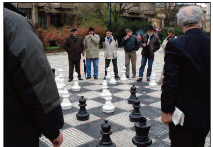
Street chess: Although Bosnians live amid an apparent facade of freedom, most contemplate and talk of a better life elsewhere.