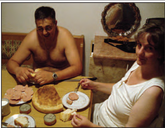
Bosnians still rely on international food aid for survival - supplementing their meager incomes.