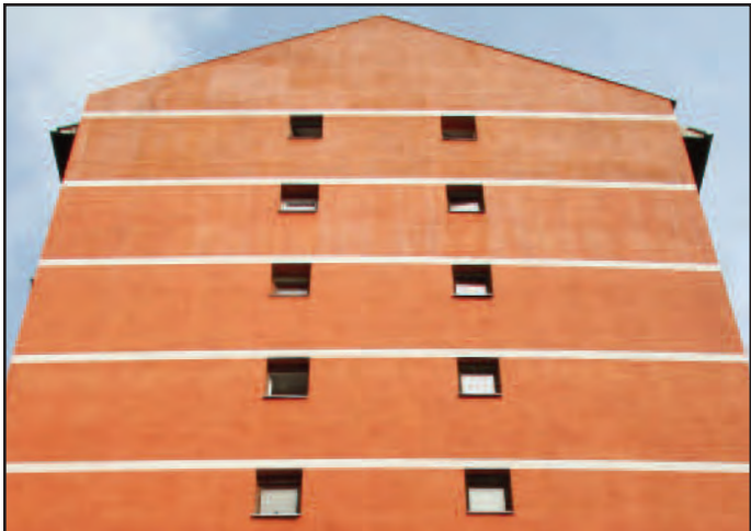
This is the same apartment building as above, in 2009. The front side remains heavily damaged. Many homes and other buildings in Sarajevo have been either repaired or built, especially since 2007.